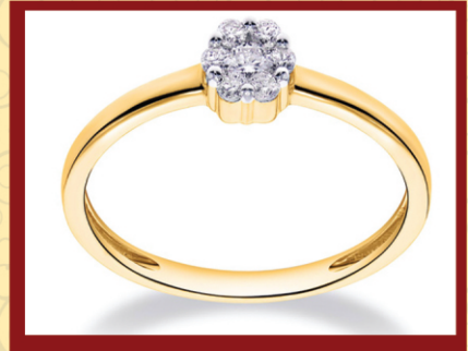
Jhara - 1