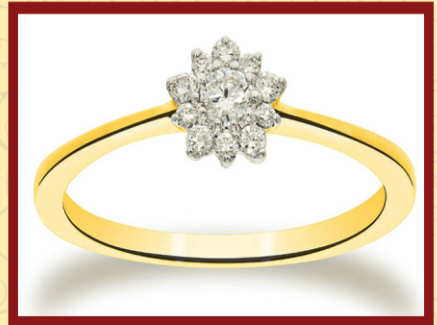
Jhara - 3