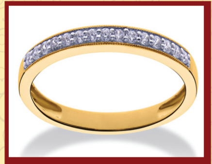
Jhara - 2